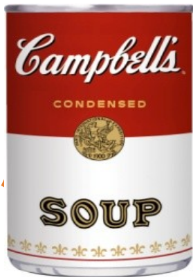
Soup for Schools