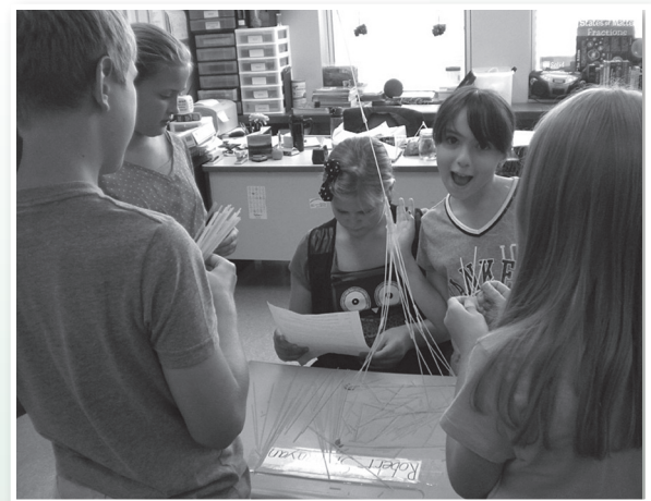
Arongen gr. 5 students work together exploring strategies for building spaghetti towers, while they get to know each other on the first day of school.