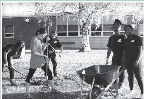
High School West students take pride in their school during Freshmen Give-back Day!

Skano third-grade students work with clay to create architecture in art class. Designing and building creative structures!