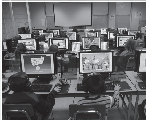
Mrs. Francois' 2nd-grade class at Arongen are learning their math facts through an online interactive program called Reflex Math.

Universal pin numbers for students' food services accounts has been implemented. Now a student's pin number will follow him/her from school to school. ■