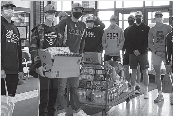
Shen is In! We are in it together! Shen Baseball collects donations for the district's Bountiful Backpack Program to fight food insecurities in our community.