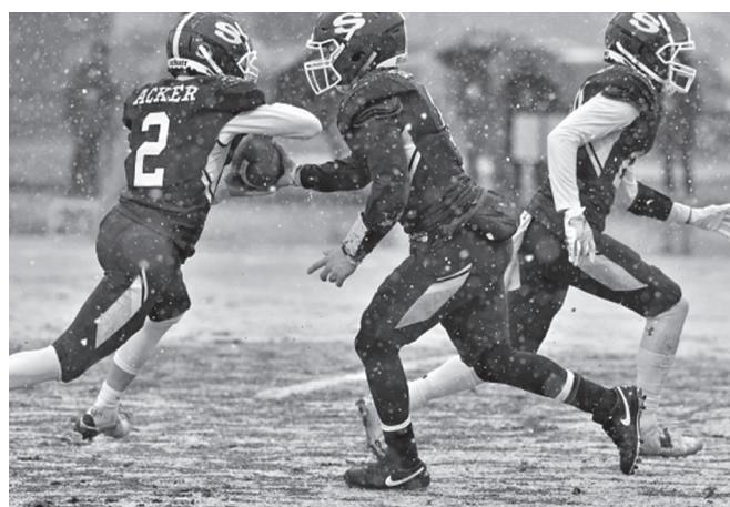
Shenendehowa football defeats CBA on a snowy April Fools Day.