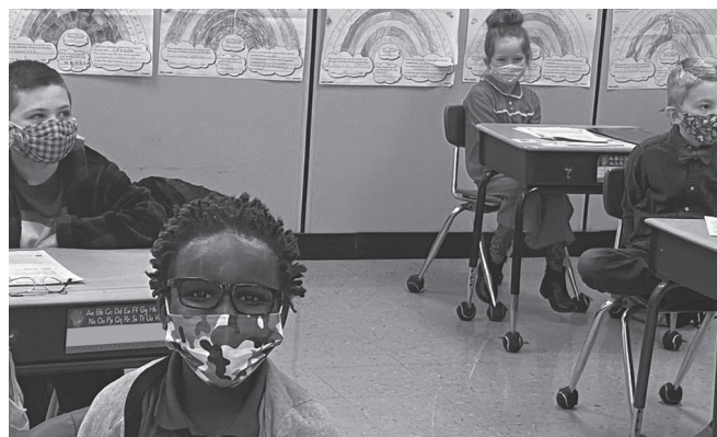
Chango Elementary students celebrate the 100th day of school.