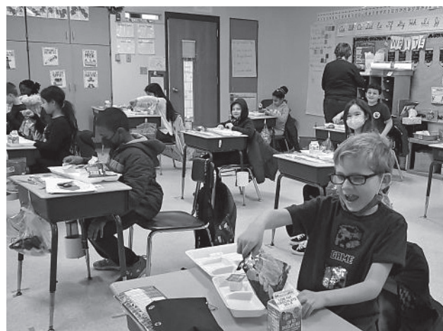
Shenendehowa's Food Service Department provides pancake breakfast to Arongen Elementary third graders as they read a book entitled "Pancakes for Breakfast" by Tomie DePaola.