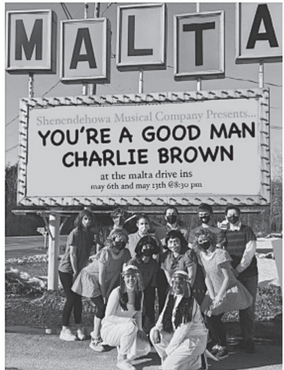
Thinking outside the box during COVID-19, the Shen HS Musical Company presented You're a Good Man Charlie Brown at the Malta Drive-in.