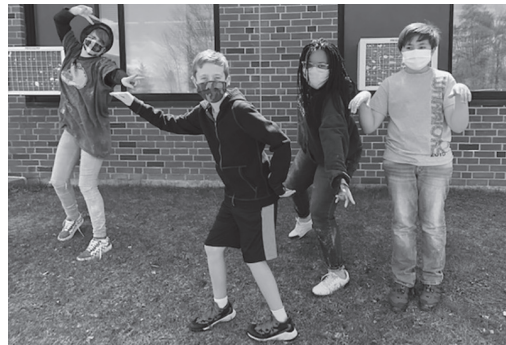
Gowana eighth graders engineered systems to respond to a 14-foot egg drop