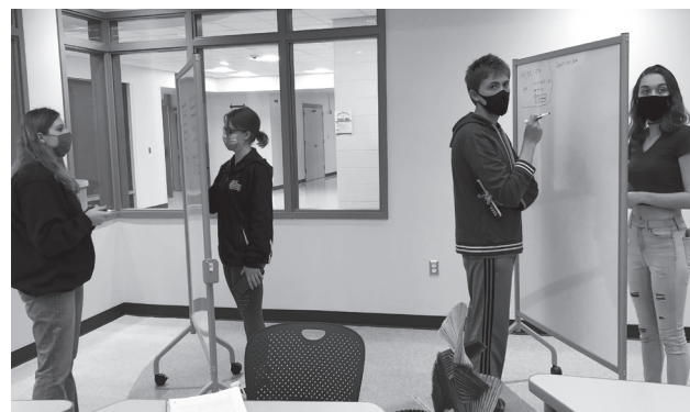
Shen High School math students engaged in collaborative work in the showcase science classroom, part of the new STEM Center in High School East.