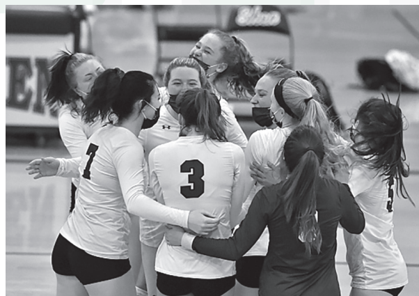
Girl's volleyball team celebrates victory!

The district's 214 buses (excluding this COVID year) travel 1.9 million miles per year. Shen bus drivers participate in 75-100 hours of behind-the-wheel and classroom training before they drive students. After that, bus drivers attend up to twelve hours of training each year on various topics including student management, defensive driving, accident avoidance, disaster preparedness and first aid. All bus drivers are subject to fingerprinting, federal drug and alcohol screening, annual defensive driving tests, biennial behind-the-wheel road tests and physical performance tests.