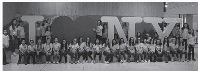
The Middle School Treble Choir performed for Music In Our Schools Month at the Capitol building.