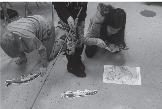
Chango fourth graders investigated several NY fish species in local waterways as part of the "Go Fish" program run by Cornell Cooperative Extension