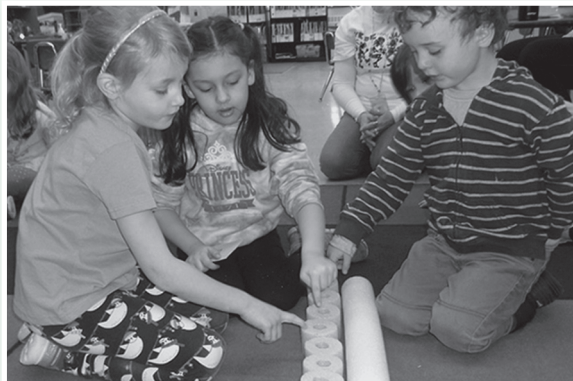
Skano kindergartners use pool noodles for hands-on practice building teen numbers.

You are eligible to vote if you are a U.S. citizen, 18 years or older and have been a Shenendehowa district resident for at least 30 days prior to the vote. No preregistration is required but official personal identification with photo is required at the polls. It is a crime to falsify votes (i.e., voting twice, or using false identification).