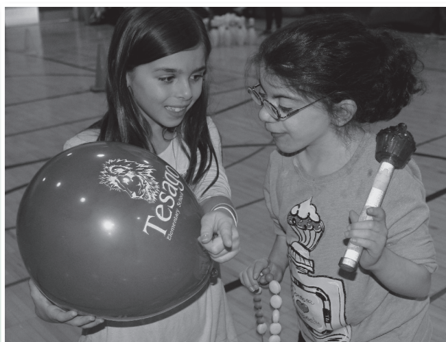
Tesago Best Buddies always have fun together.