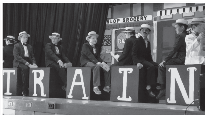
Orenda students perform The Music Man, Kids .