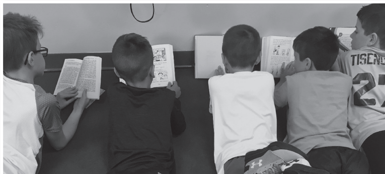
Arongen students get to know each other through book share time.