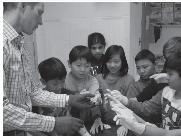
QUEST students at Tesago participate in a parent presentation of a dissection as part of their science biology unit.

XX candidates are running for three seats on the seven-member Board of Education that are up for election. Members serve without pay. The two candidates with the highest number of votes will serve a three-year term and the candidate with the third highest number of votes will serve the two-year term all commencing July 1, 2018.