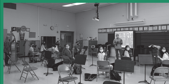
Shenendehowa High School is still making music!