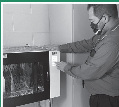
Shenendehowa Information Management Systems (IMS) staff members set up a Chromebook sanitizing machine in the Middle School ChromeCare Center.