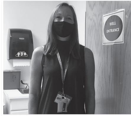
Nurses reworked their offices to create well entrances/areas and sick entrances/areas.

The system also allows for recorded voice calls, again, only by district-level officials. Right now, everyone is set to receive those, just like e-mail. We will provide directions in the future how to opt out of those if you wish to do so.