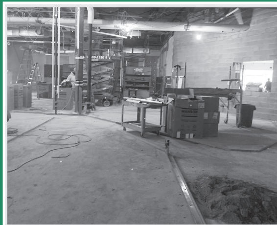
The new technology wing at Shenendehowa High School East is on track for its grand opening September 2020!