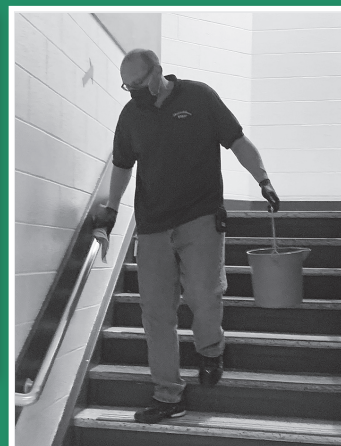
All surfaces are wiped down regularly thanks to Shenendehowa's maintenance staff!