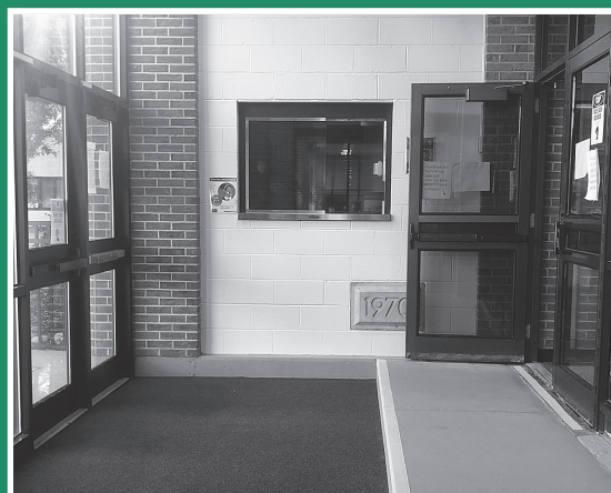
The entrance at HS East was reworked to add a welcome vestibul to provide entrance into the building during the school day.