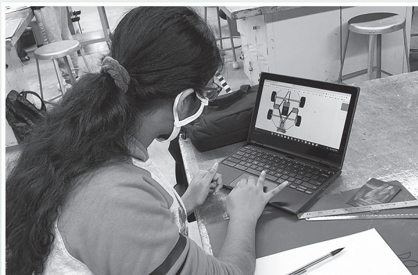
Gowana technology students working on Autodesk Inventors Tinkercad 3D modeling software. They are then taking the 3D computer models and building small electric cars from their designs.

The NYS Department of Health has created a COVID Dashboard. School districts must report daily whether or not any COVID-19 cases have been confirmed within the district. ( https://schoolcovidreportcard.health.ny.gov/#/home )