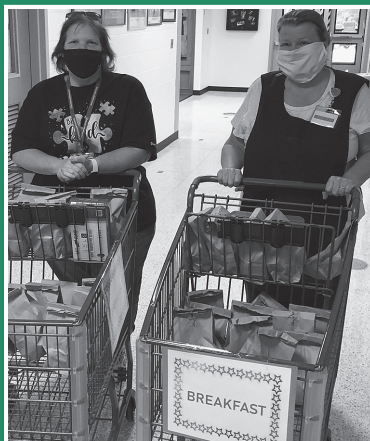
Chango Food Service staff delivers breakfast to the classrooms on carts!