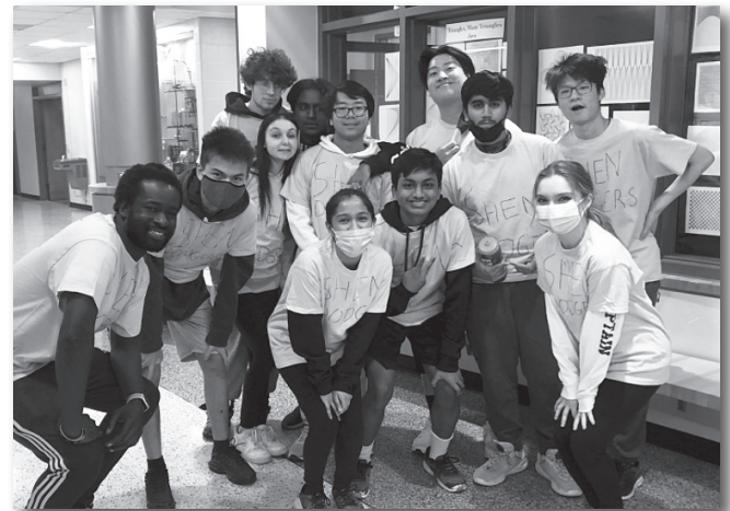
Students participate in the Student Faculty Administration (SFA) Senate Dodgeball tournament at High School East.