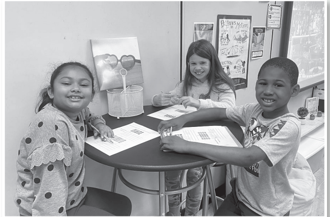
Ms. Salvi's students at Chango Elementary work on math skills, focusing on the community property in small groups.