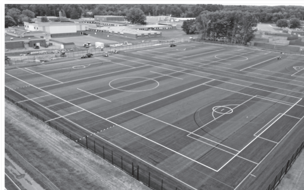
Two multi-purpose turf fields now host Physical Education classes across all three middle schools.