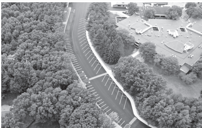
65 additional parking spots were added behind High School East.