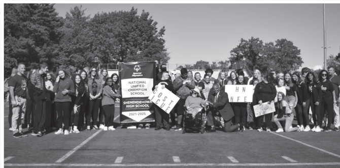
Unified Sports and Unified P.E. students celebrate their National Banner status at the Spirit Rally before Homecoming.

The future is bright for the Unified program at Shenendehowa with plans to model Unified P.E. at the Middle School level while continuing to provide inclusive opportunities throughout the district.