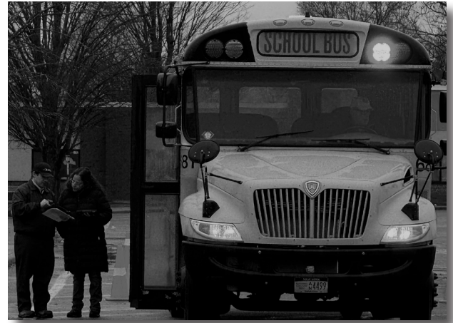
Shen Transportation became a certified DMV "third-party testing site" authorized to administer CDL road tests to license new recruits.

Safety is always front of mind in all aspects of the Shen experience. To provide services for children with special needs, School Bus Attendants are certified through a mandated Pre-service course. All of our bus attendants are CPR-AED-EPIPEN certified.