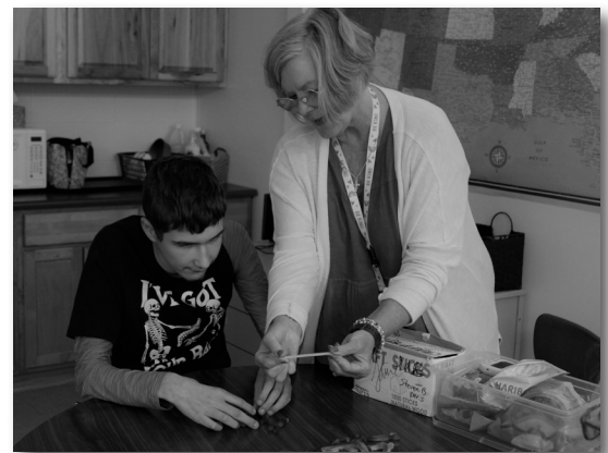
In one of the High School Special Education classes, students participated in hands-on activities to assist with motor skills and problem-solving.

As we look to the future of education at Shen, we will continue to champion the diverse needs and potential of every learner.