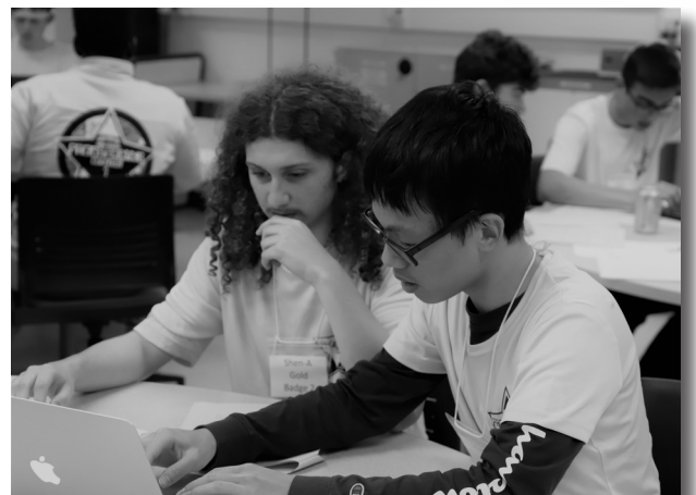
Students from the High School Technology Department participated in the 36th annual programming contest at Siena College.