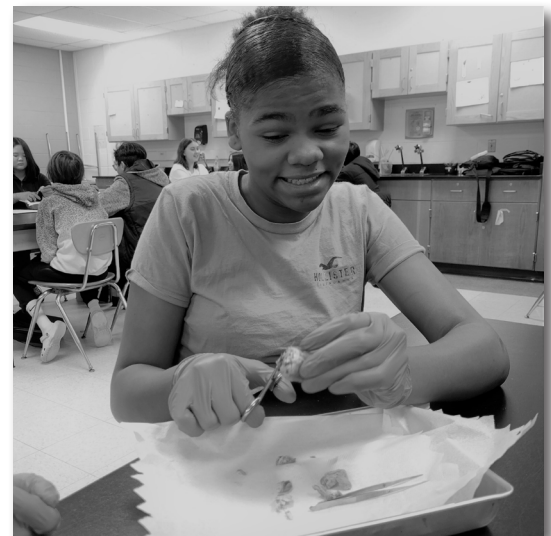
Koda 7th graders learn about biology by participating in a dissection during science class.

You are eligible to vote if you are a U.S. citizen, 18 years or older and have been a Shenendehowa District resident for at least 30 days prior to the vote. No preregistration is required. Official personal identification with a photo is required at the polls. It is a crime to falsify votes (i.e. voting twice or using false identification).